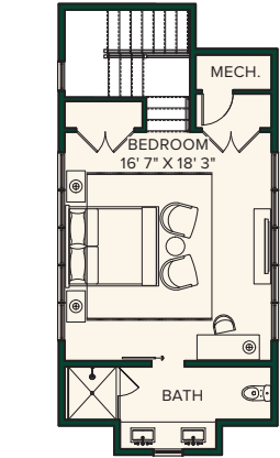
UPPER LEVEL BEDROOM