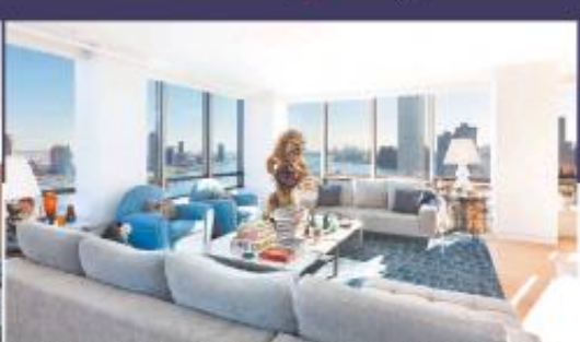
860 United Notions Plaza (Mattown | $2,550,000 | Securific I BR. 3 BA high-floor corner hame leaturing exceptional vises that extend to lower Manhottan bridges. Web# 4631664