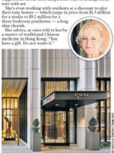
See IN-HOUSE EXPERTS on Page 38