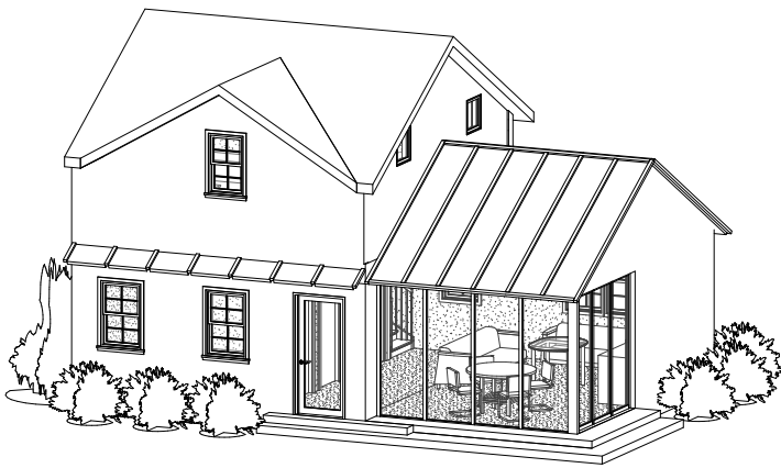
① FRONT VIEW