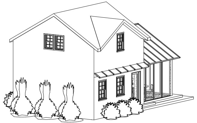
② SIDE VIEW 1