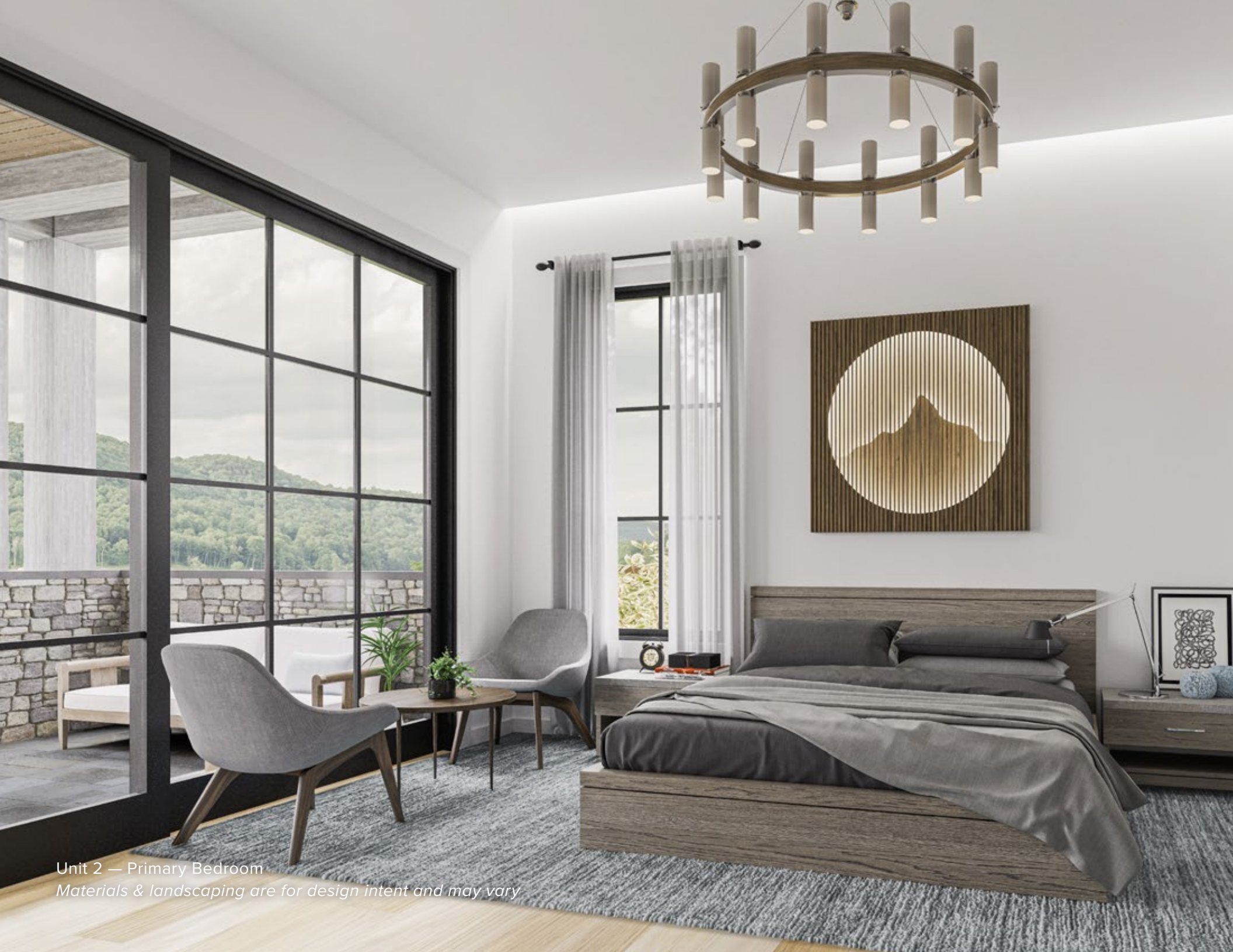
Unit 2 — Primary Bedroom Materials & landscaping are for design intent and may vary