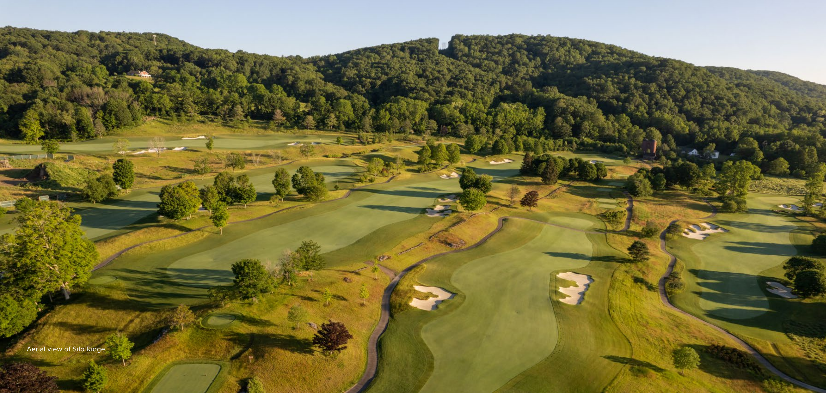
Aerial view of Silo Ridge

For more information about this property and its pricing please contact Silo Ridge Realty.