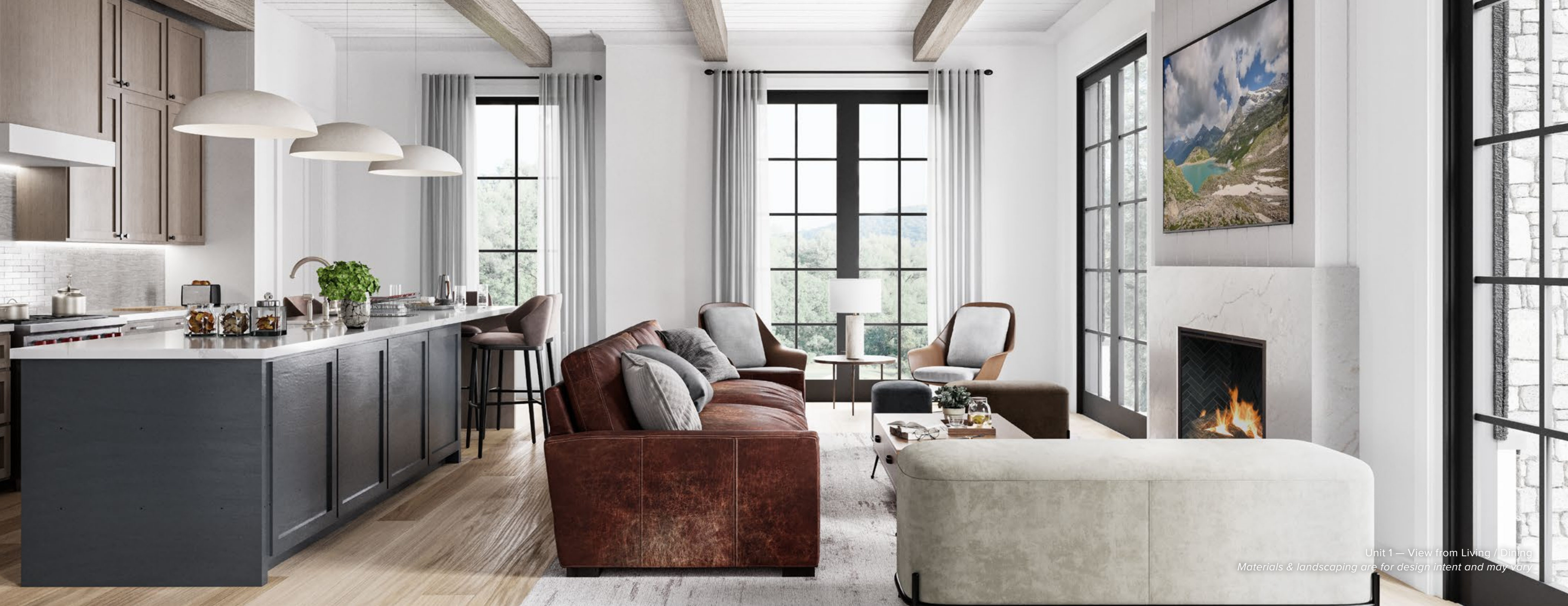
Unit 1 — View from Living / Dining Materials & landscaping are for design intent and may vary