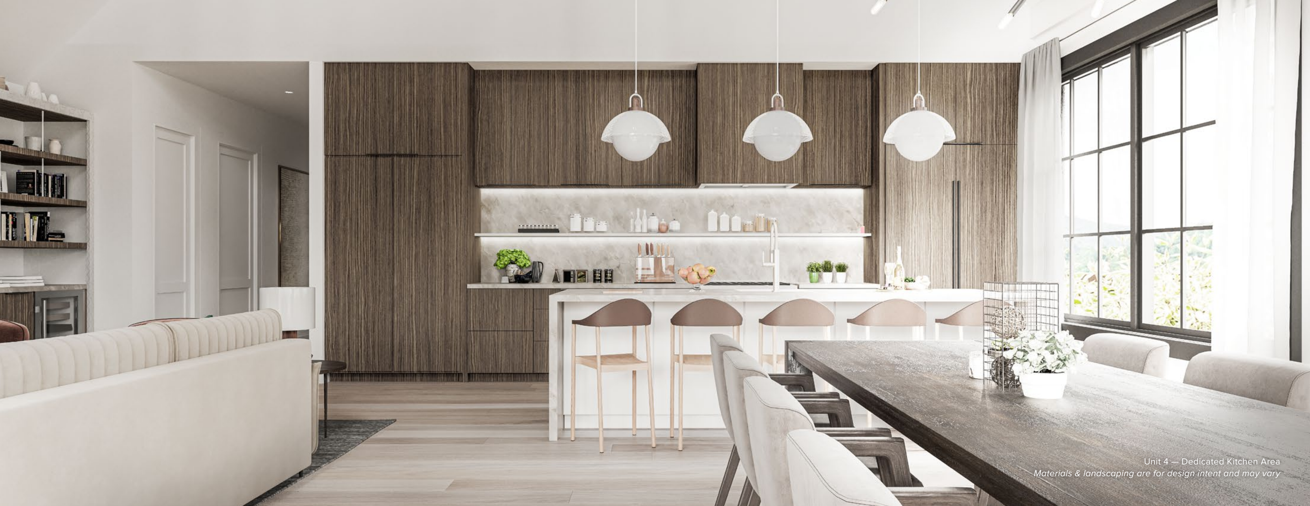
Unit 4 — Dedicated Kitchen Area Materials & landscaping are for design intent and may vary