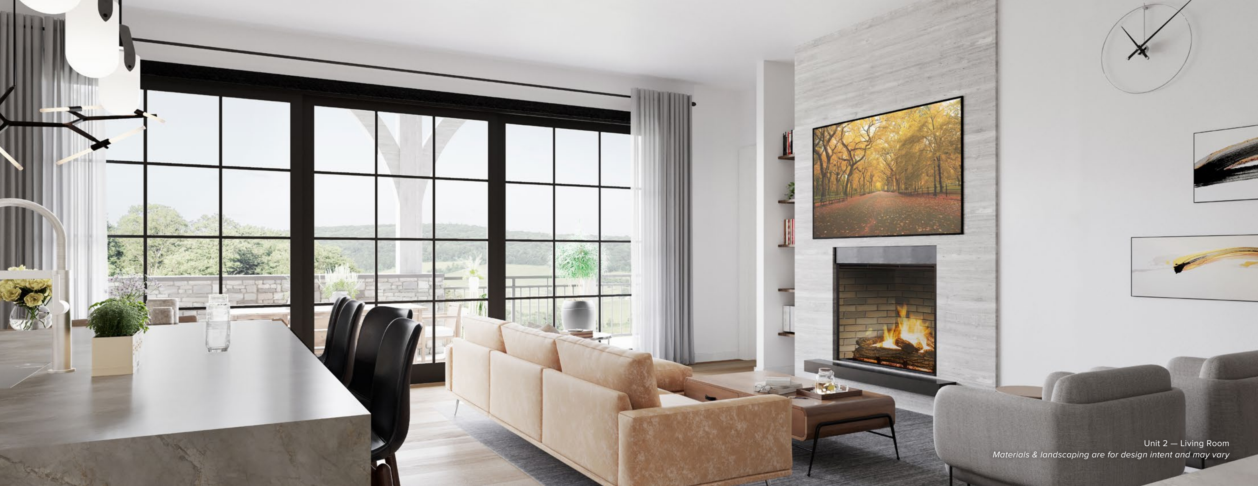
Unit 2 — Living Room Materials & landscaping are for design intent and may vary