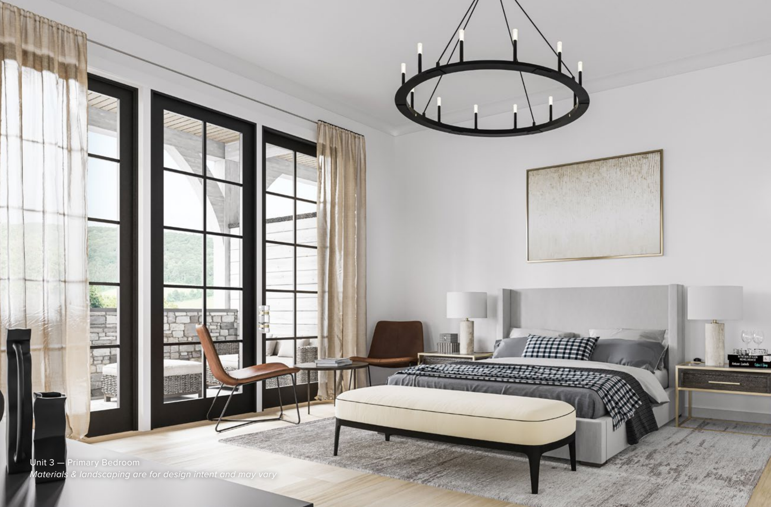
Unit 3 — Primary Bedroom Materials & landscaping are for design intent and may vary