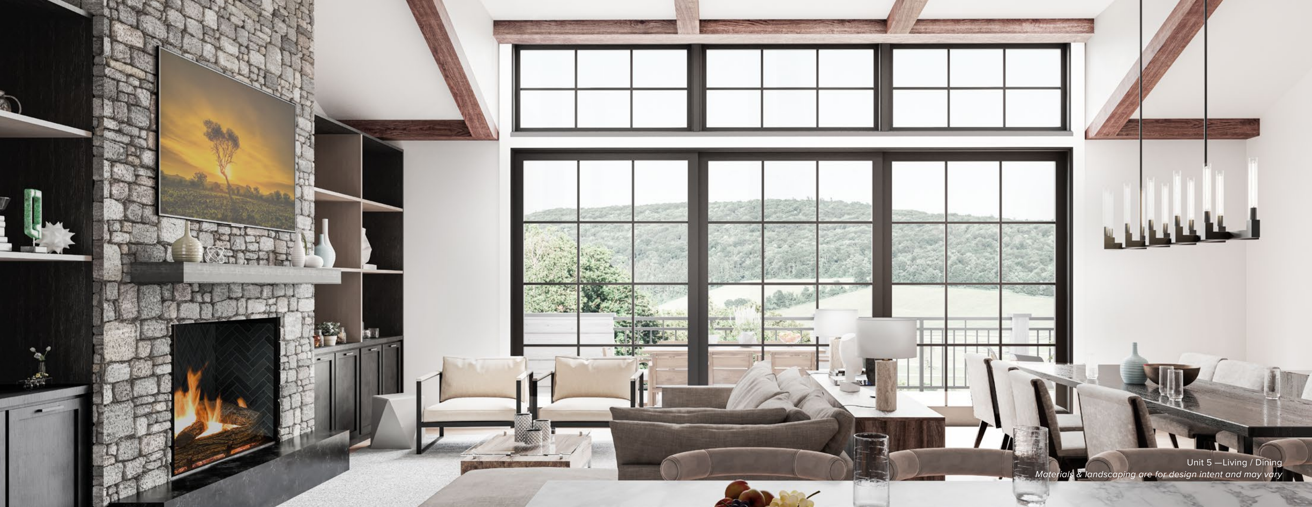
Unit 5 — Living / Dining Materials & landscaping are for design intent and may vary