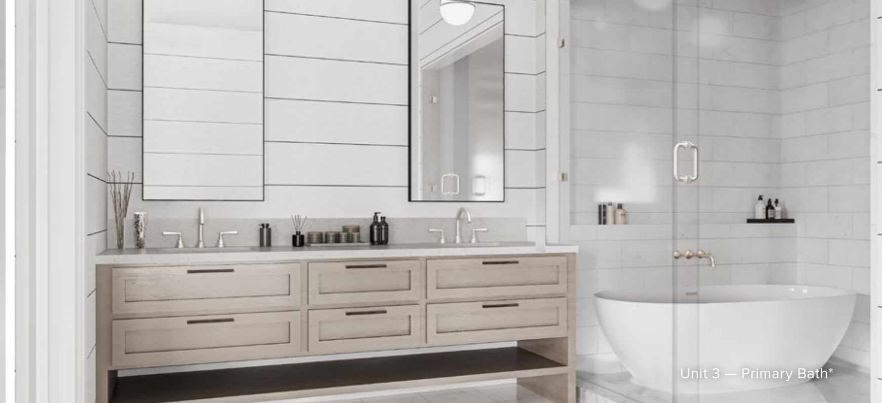
Unit 3 — Primary Bath*