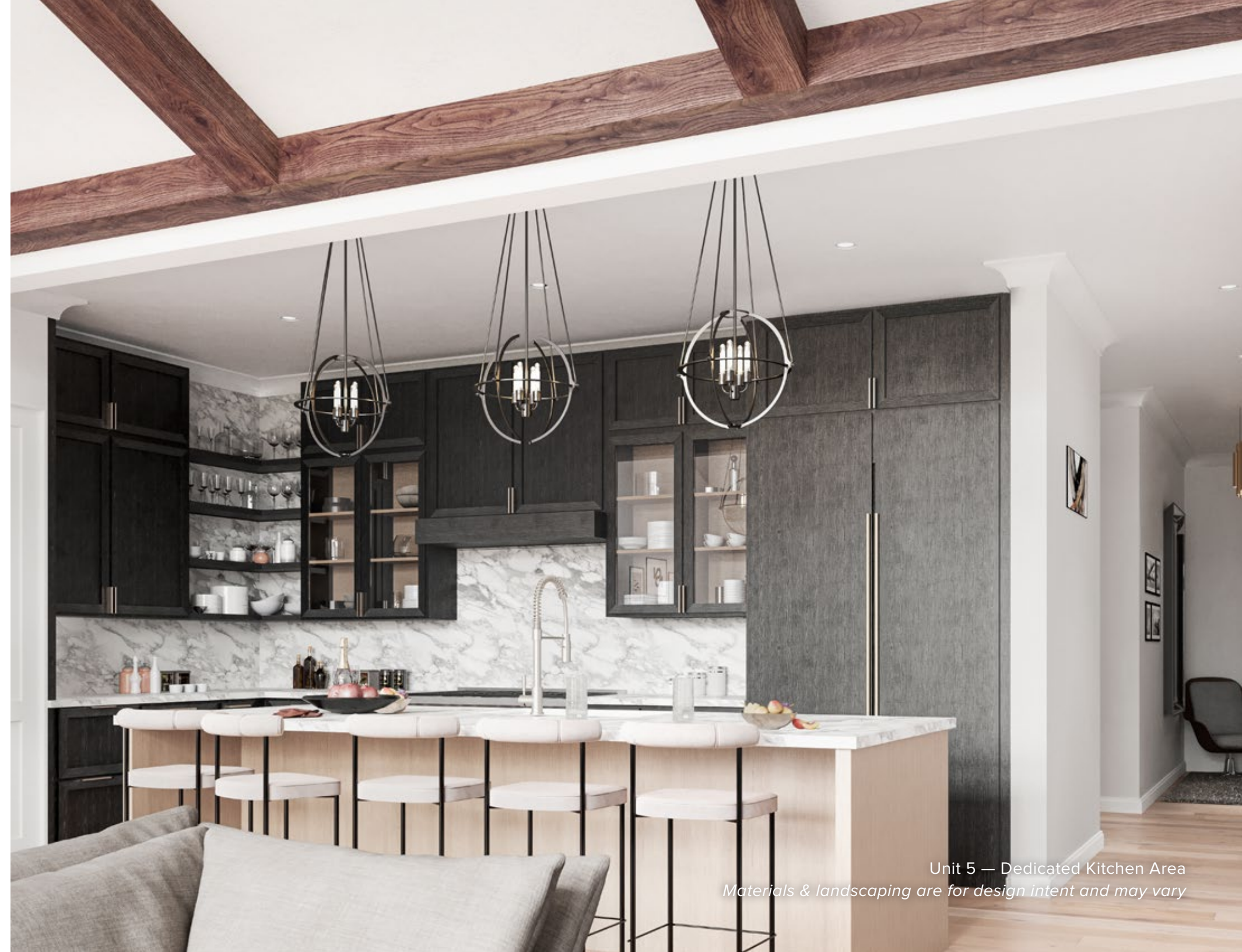
Unit 5 — Dedicated Kitchen Area Materials & landscaping are for design intent and may vary