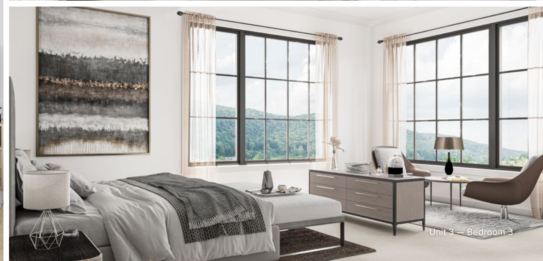
Unit 3 — Bedroom 3