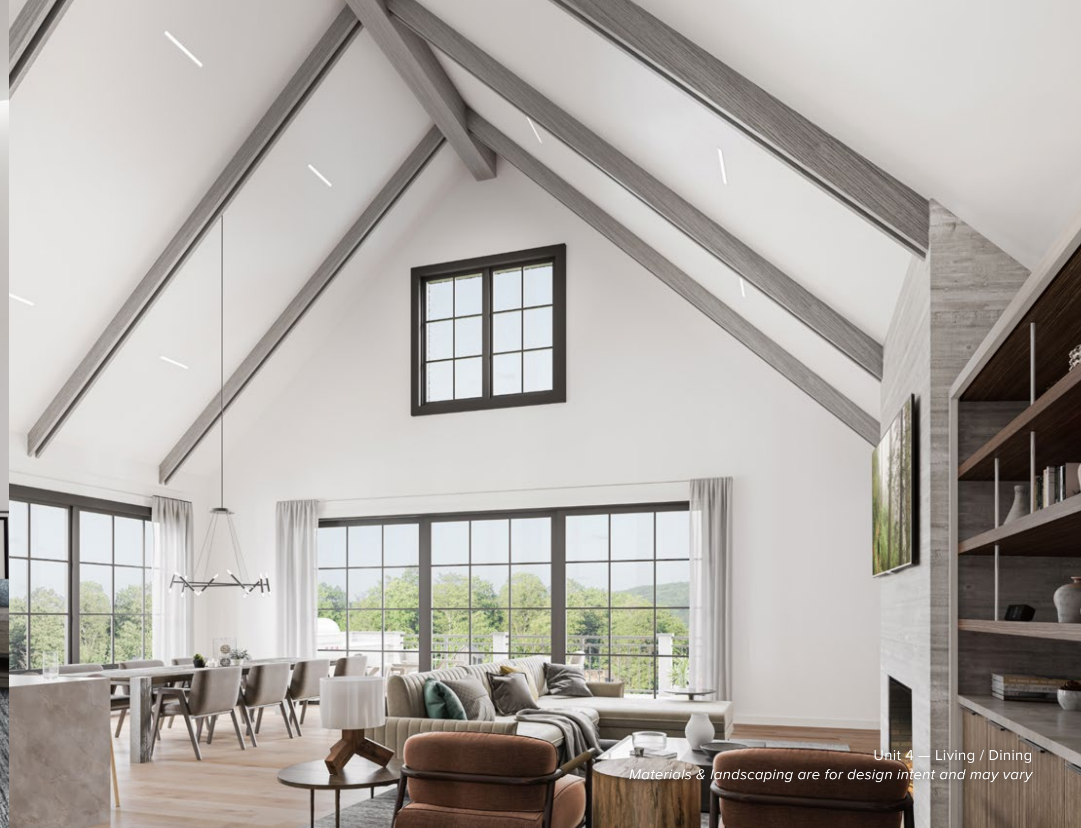
Unit 4 — Living / Dining Materials & landscaping are for design intent and may vary