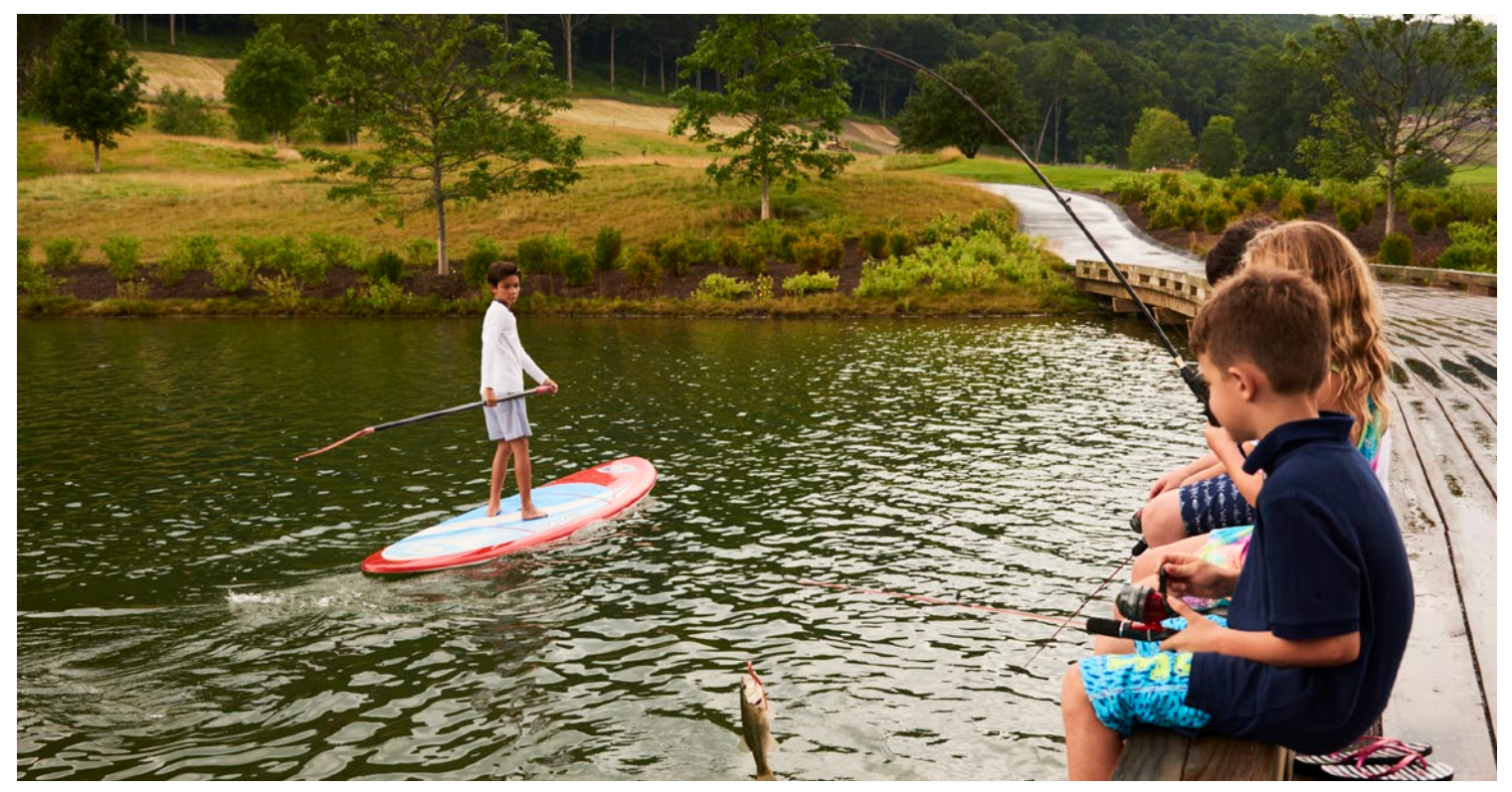
Silo Ridge Field Club's lake offers paddleboarding, kayaking, canoing and fishing.