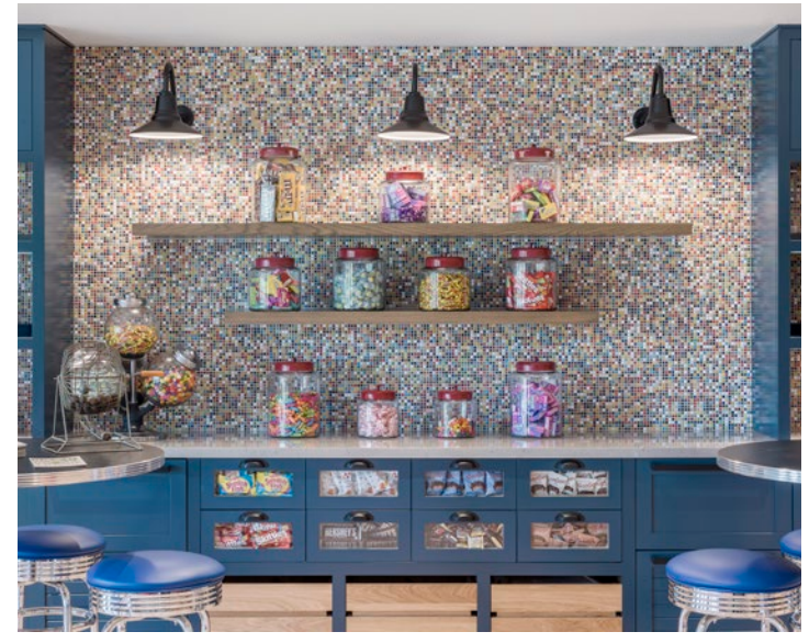
Whimsical candy station