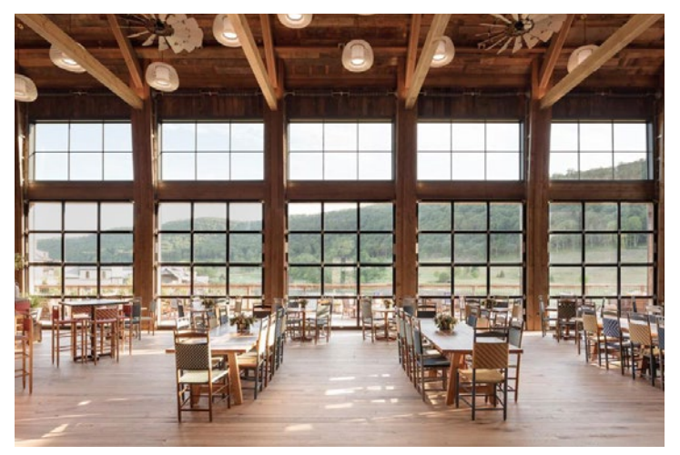
The Barn offers a 120-seat dining room, bar, double-height fireplace, and long farmhouse-style tables for gatherings