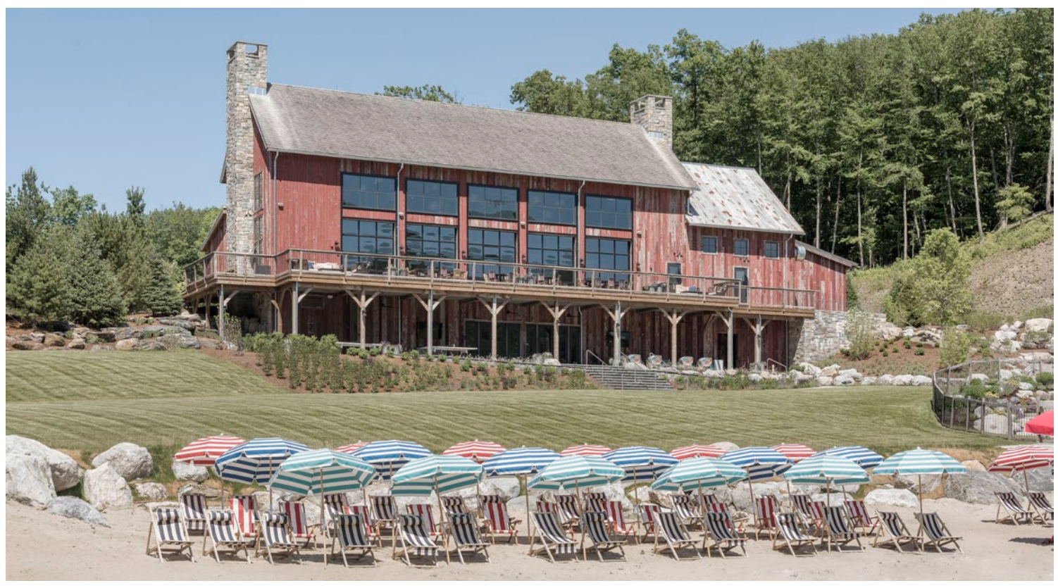
The Barn's designed utilized traditional construction, weaving, and milk paint finishing techniques.

Now, as New York state successfully lowers COVID-19 cases, a new phase of reopening coincides with the debut of The Barn , Silo Ridge's brand new 11,000-square-foot multipurpose family entertainment, activity and casual dining space.