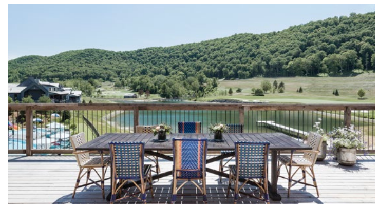
Sweeping view of lake, pool and landscape from The Barn's expansive upper deck.