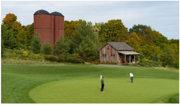
Rusty silos and comfort stations are among charming outposts along Silo Ridge's golf course.

Primarily a second residence community, Silo Ridge has been an ideal quarantine escape. More than 100 owners have ridden out the coronavirus epidemic in the sociallydistanced enclave—playing virtual bingo, bakeoffs, and Zoom workouts. Thirty-five percent sold, there's still time to escape the city for this quaint getaway.