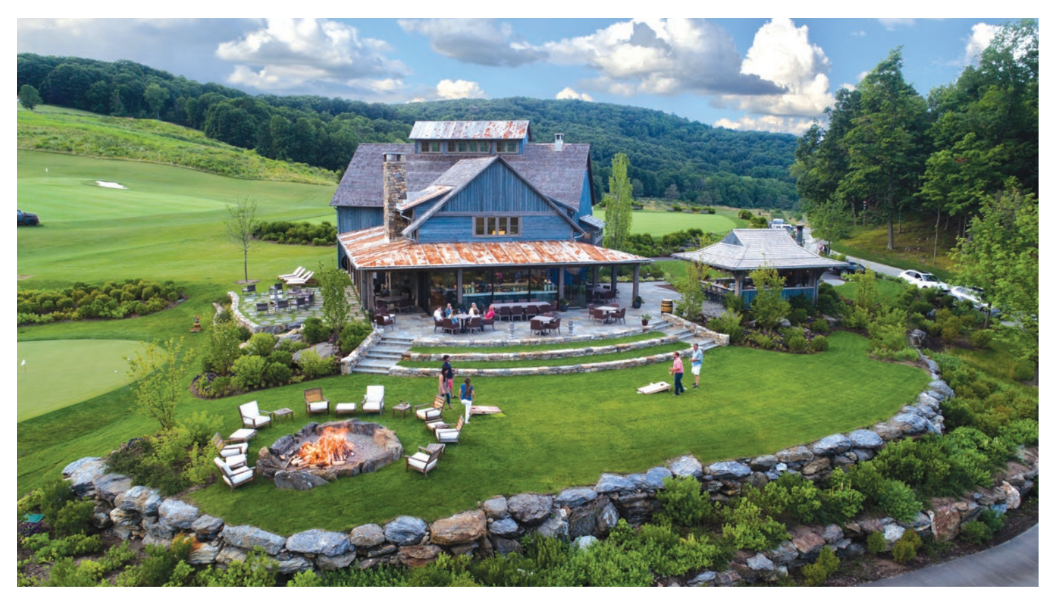
Ridge House amid a verdant landscape. More than 100 members rode out the coronavirus shutdown at Silo Ridge Field Club, an 850acre gated community.