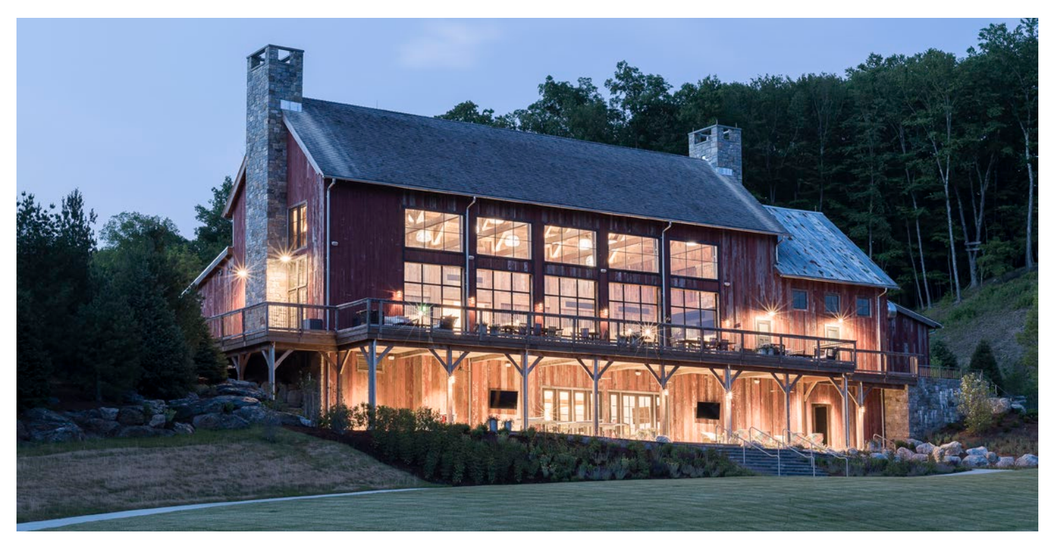
The Barn is Silo Ridge Field Club's new 11,000-square-foot multipurpose family entertainment, activity and casual dining space.