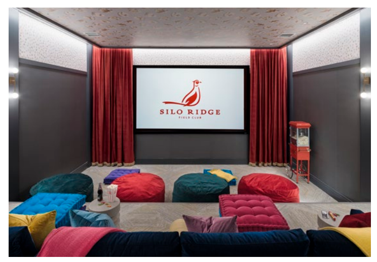
The Barn movie theater