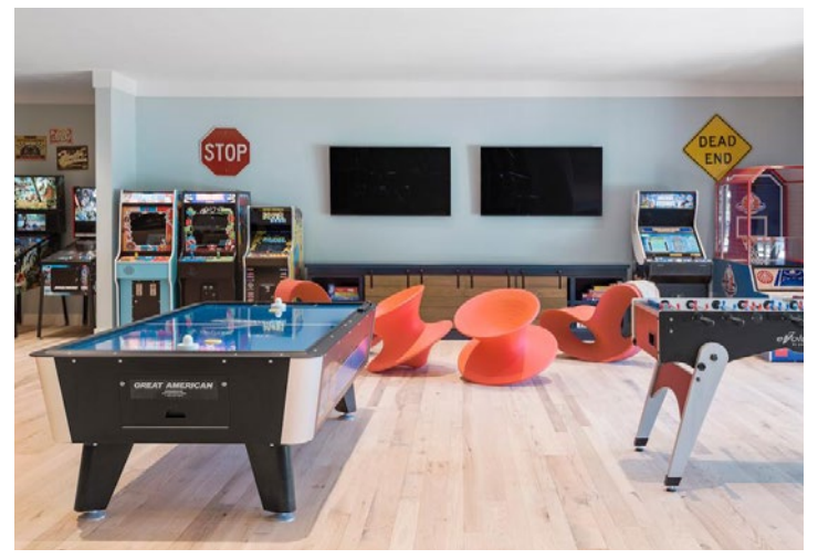
Kids game room on The Barn's lower level

Collaboratively designed by Alder & Tweed, WC Ralston Architects and others, the sustainable facility is inspired by Hudson Valley architecture and executed by local artisans who infused Shaker-style furnishings and vintage accessories into the design.