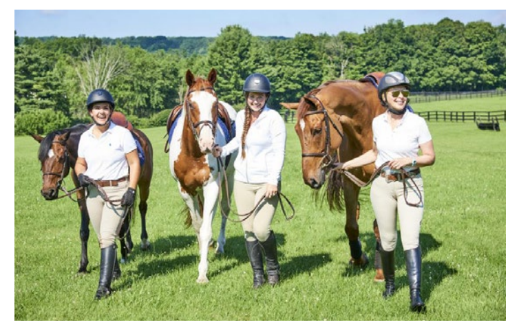
Silo Ridge Field Club's Outdoor Pursuits program offers members guided excursions, including horseback riding.

Oak floors, reclaimed wood, locally-sourced stone, folk art, and Americana relics lend authenticity to The Barn's flexible spaces and the cultural landscape. Even The Barn's exterior boasts reclaimed wood from a local barn.