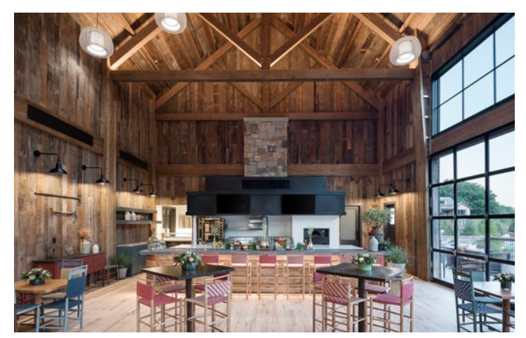
The Barn offers a 120-seat dining room, bar, double-height fireplace, and long farmhouse-style tables for gatherings.

Here, resident members can enjoy concerts, movies, televised sports, arts-and-crafts, and local terrain-to-table fare at private or communal tables. The Barn includes a relaxed 120-seat dining room, bar, double-height fireplace, and long farmhouse-style tables for family and friend gatherings.