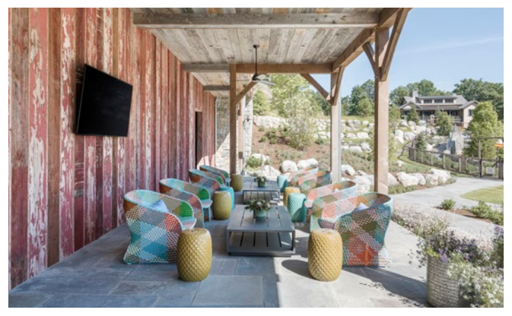
The Barn's kid-friendly lower level is decorated with reclaimed wood and whimsical colors.